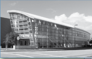
Oracle Conference Center